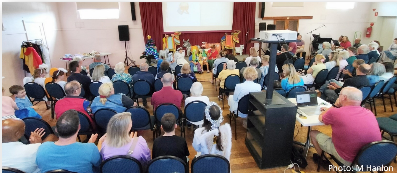
Above: Families enjoy the nativity story in the Parish hall, along with regular St Philip's worshippers.