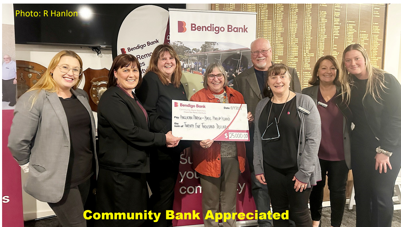
Community Bank Appreciated

Grant us wisdom and direction as we ride, that we may honour You in all that we do. Fill our hearts with Your love and compassion, that we share Your light with everyone we meet along the way. Strengthen our bonds of fellowship and let our rides be a testament to Your grace and Mercy. Amen